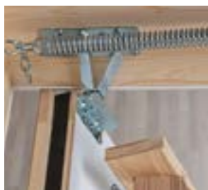
Patented arm system for easy and quick fitting