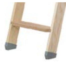
1 person install

DOLLE clickFIX® 36G MINI loft ladder with 30 mm insulation = U-value 0,99 W/m 2 *K.