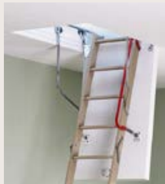
Flush ceiling installation - integrated in plaster board