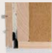
Integrated plasterboard solution

DOLLE clickFIX® loft ladders comes with two options, one for flush installation integrated in the plaster board or a second option to use architraves that visually conceal the installation gap. Both options are designed to be simply attached to the casing for a seamless finish.