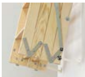
4 section timber ladder