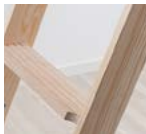
Complies to EN 13501-2 Approval