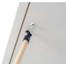
Comes complete with handrail