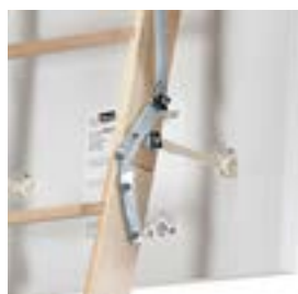
Fits in small openings