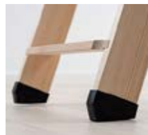
Loft ladder in top quality

DOLLE REI 45 has a fire resistance of 45 minutes and complies with EN 13501-2. The trapdoor is insulated with 50 mm rockwool plate, which is made of non-combustible, moisture and water-repellent Rockwool stone wool. The trapdoor has a nice finish in white HDF plate with hidden hinges and has high quality lock.