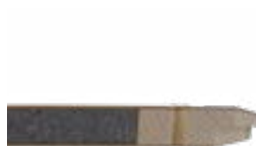
Trapdoor with super EPS insulation