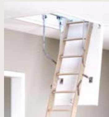
Installation with architraves