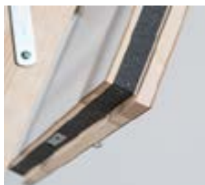
Can withstand fire for 45 minutes