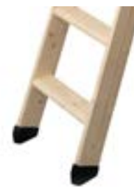
High Quality - 10-years guarantee

DOLLE SW40-5 is a 3 section folding loft ladder. It requires no headroom or storage space in the loft. Trapdoor with 34 mm top-insulation material, super EPS that ensures the improved U-value: 1,16 W/m 2 *K. The ladder is with non slip treads and has plastic feet included for extra security. It has a nice finish with white faced trapdoor and is delivered with plastic architraves and rubber draught excluder to prevents loss of heat and draught. The DOLLE SW40-5 has a special developed height adjustment system and it comes complete with a wooden push/pull rod for easy operation.